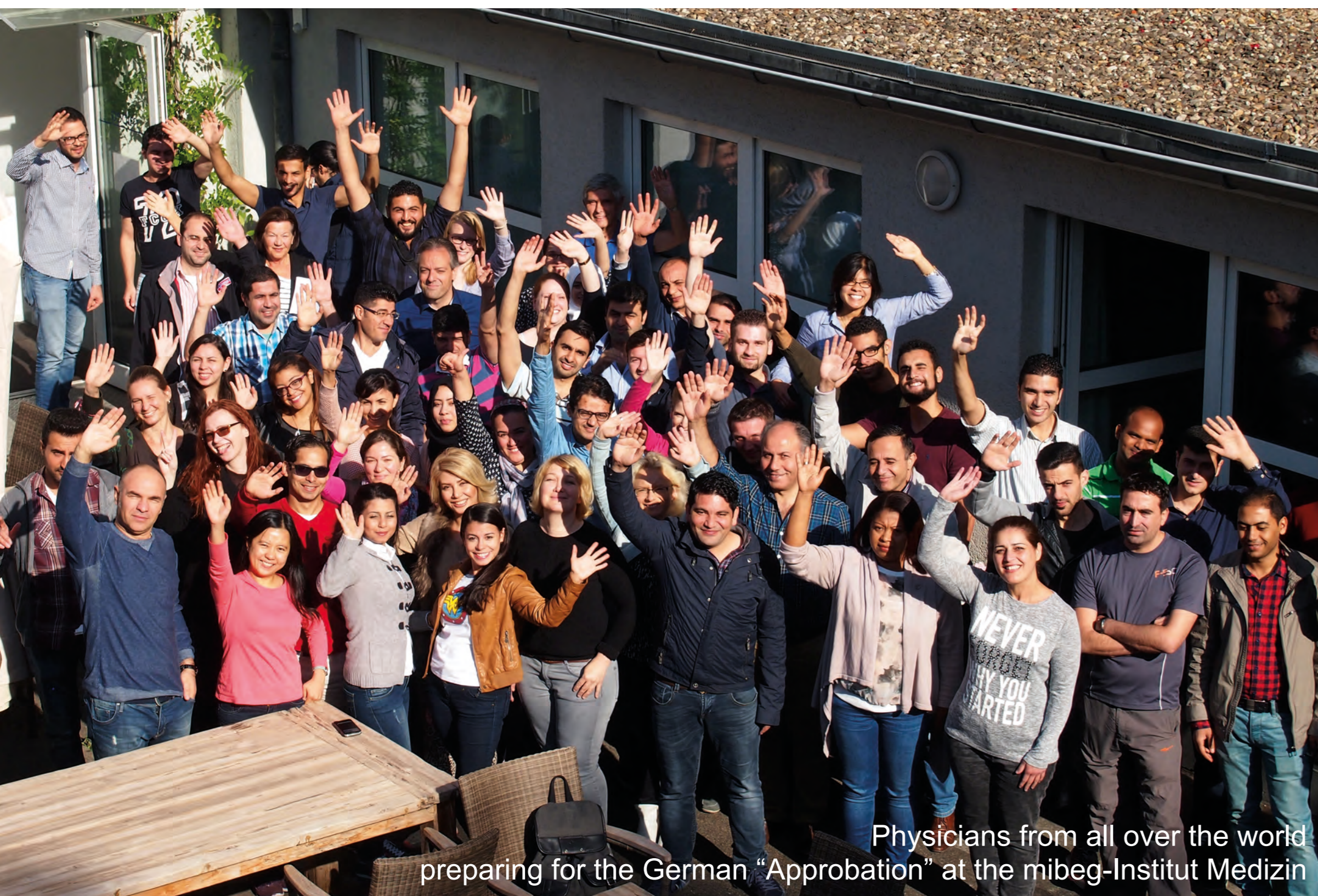
Physicians from all over the world preparing for the German “Approbation” at the mibeg-Institut Medizin